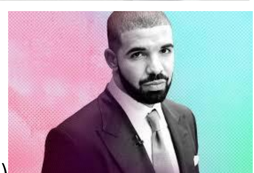
(Canada is cool)